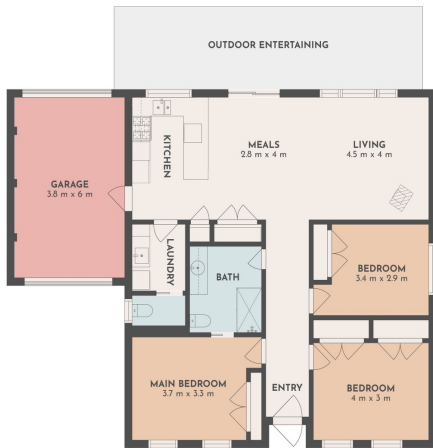
15/13 VISTA COURT, GEMBROOK TOTAL INTERNAL - 145m 2 SIZES AND DIMENSIONS ARE APPROXIMATE, ACTUAL MAY VARY